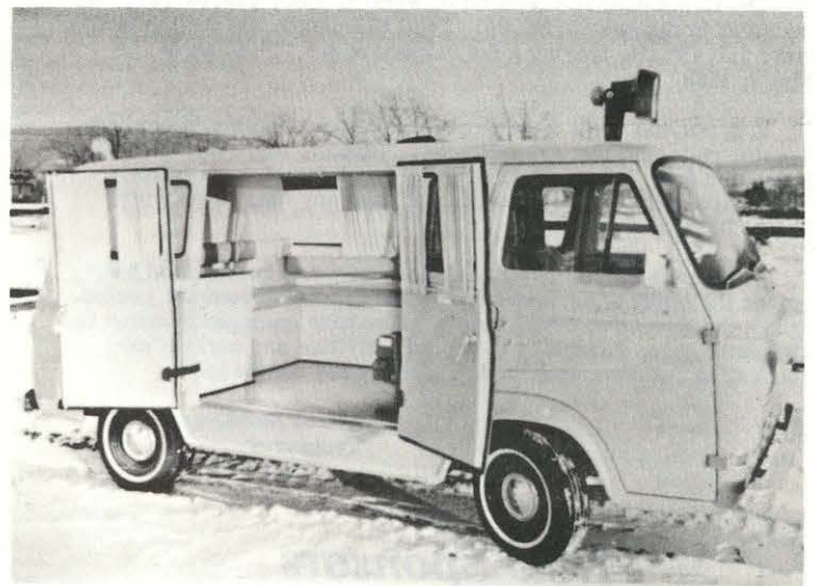
"THE TRAILBLAZER" Medical Clinic as built for Medical Committee for Human Rights.

The interior body is designed to transport seated patients or personnel. It can be readily converted to carry two stretcher patients or to sleep two team members using inflatable air mattresses and sleeping bags. Electric power is provided by a portable 1500 watt generator plant. A 35 watt transistorized amplifier/PA system was provided for operation during transit off the vehicle battery or from the AC generator. Additional equipment includes portable floodlights, fluorescent lighting, steel mesh partition to separate cab section from the interior body, 50 ft. lead-in cable, linoleum floor in body interior, draw curtains in body interior for privacy.