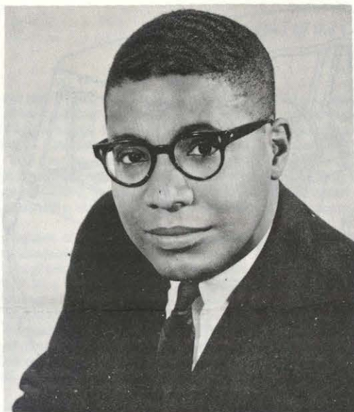
ALVIN FRANCIS POUSSAINT, M.D.

The Medical Committee, after an extensive search, has finally found an ideal man for the position of Southern Field Director. His name is Alvin Francis Poussaint; he is 31 years old and is single. Dr. Poussaint was born and raised in the East Harlem section of New York City. He attended Columbia College on a New York State Regents' Scholarship. There he fulfilled his pre-med requirements as well as concentrated studies in French. At this time he also became active in NAACP. He graduated from Columbia in 1956 and then entered Cornell Medical College. One summer during Medical School he worked as a Fellow for the New York City Department of Health doing research in prenatal care of Negro and Puerto Rican women. He was in the 1st Quarter of his class when he graduated in 1960.