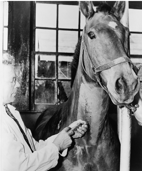
Image 1. Injecting a horse with diphtheria toxin, New York City Health Department, 1940s

1. Write your inferred definition of “diphtheria toxin,” “anti-diphtheritic serum,” and “diphtheria antitoxin” in the table below.