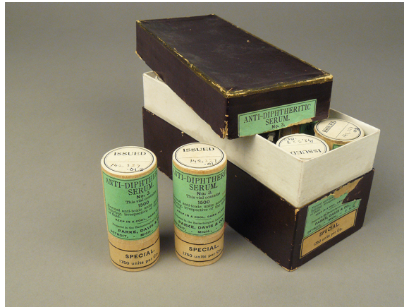
Image 2. Anti-Diphtheritic Serum, Parke, Davis & Company, ca. 1898