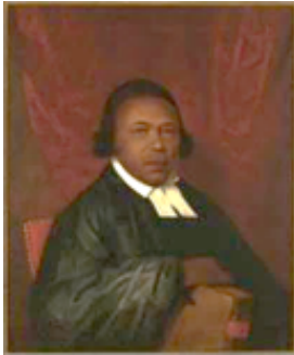
Absalom Jones , painting by Raphaele Peale, 1810.