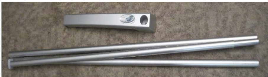
A hardware set of a collapsible pole and a metal base