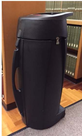
Shipping container, 48" H x 19" W x 19" D

Each exhibition travels in one or two wheeled containers with banners and hardware packed in cloth bags. See below outside and inside images of a shipping container.