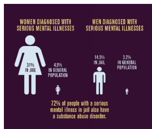
Statistics from On Life Support: Public Health in the Age of Mass Incarceration , Vera Institute of Justice, 2014