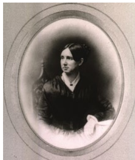
Dorothea Dix, a teacher and author, became a strong advocate for asylums. Dix helped found over 30 asylums around the country to prevent people deemed insane from being jailed or placed in poorhouses.