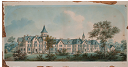
Design proposal of the Sheppard Asylum near Baltimore, MD by Calvert Vaux, 1860

Host venues for Care and Custody receive the following PR images. Please use them with their corresponding captions and credits noted below.