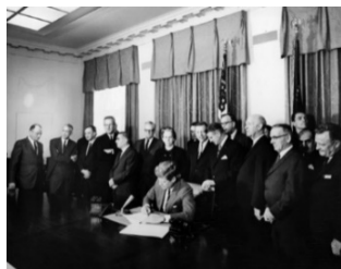
President John F. Kennedy signing legislation that allocated funds for new community mental health centers, 1963