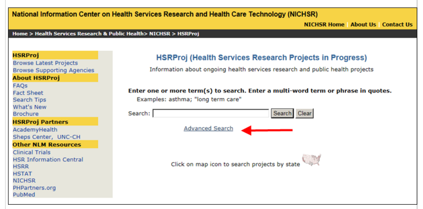
Figure 1: Link on HSRProj homepage to Advanced Search features.

From the HSRProj homepage, click on the link to the Advanced Search (see Figure 1).