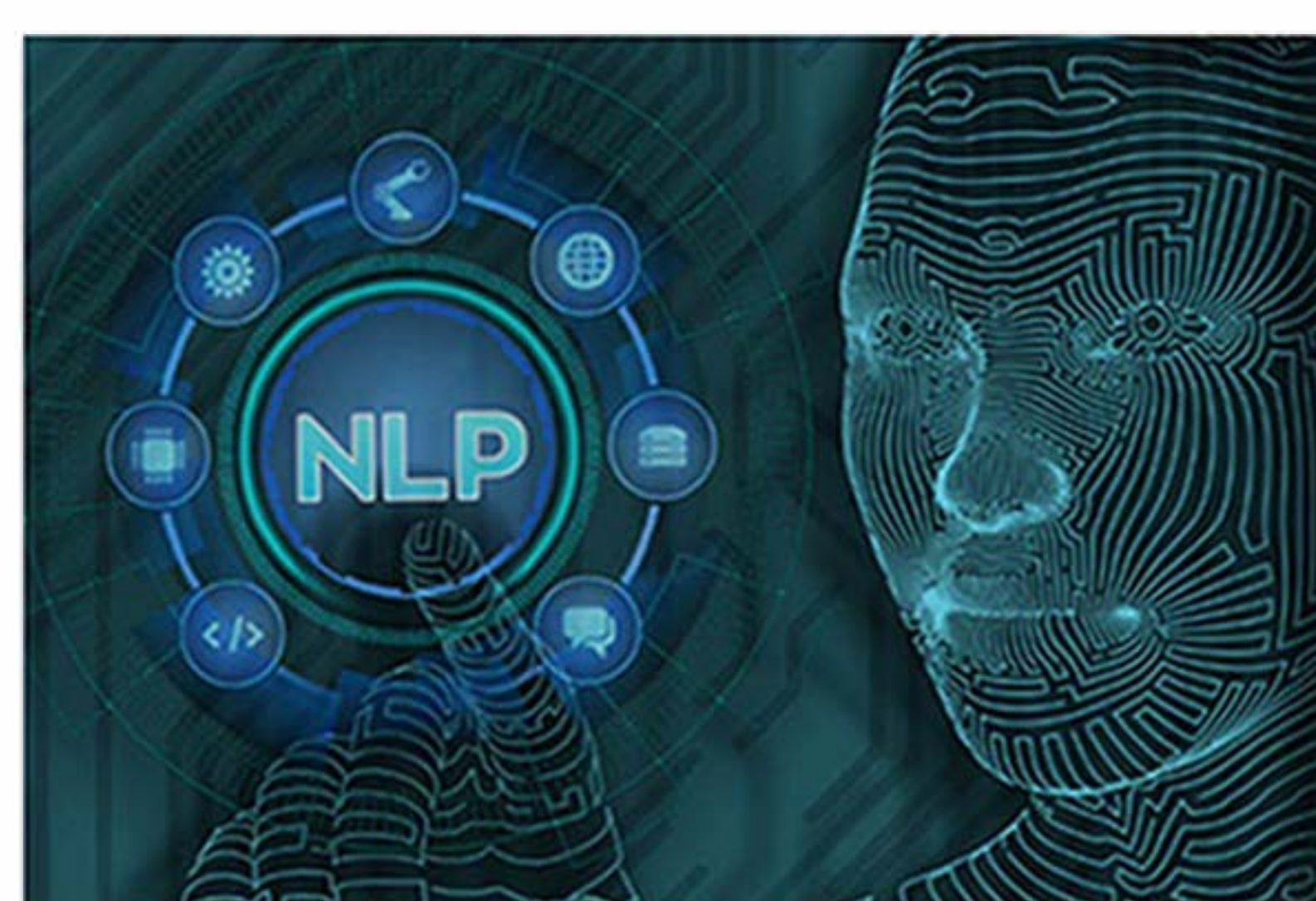
Natural Language Processing