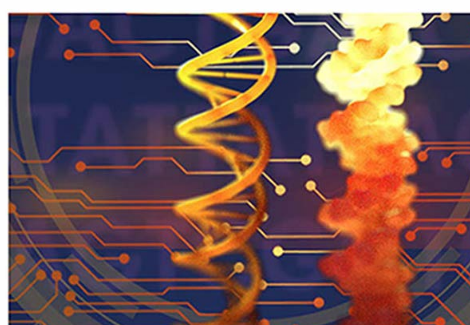
Networks, Gene Regulation, and Chromatin