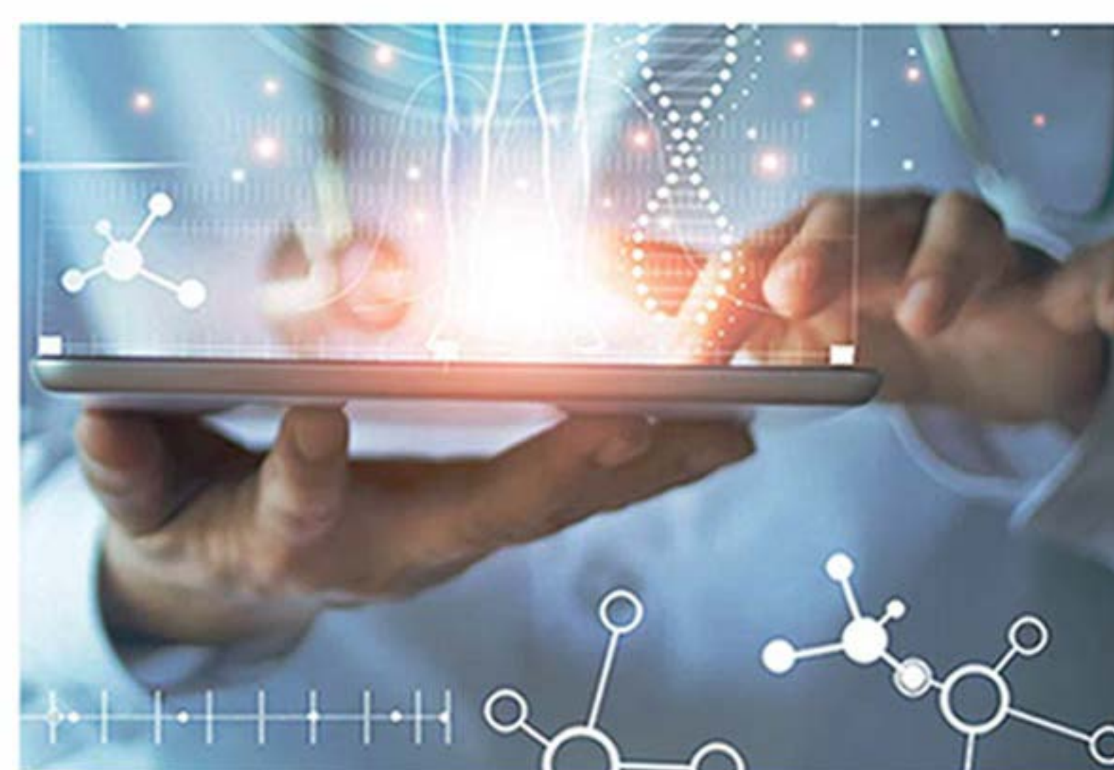
Health Information Standards and Discovery